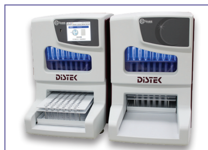
Dual Bath Parent / Child Configuration