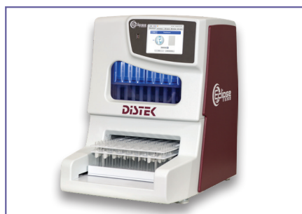
Eclipse 5300 without Filter Changer