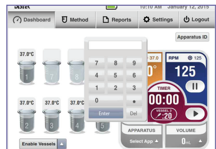
Dashboard screen with Volume Set