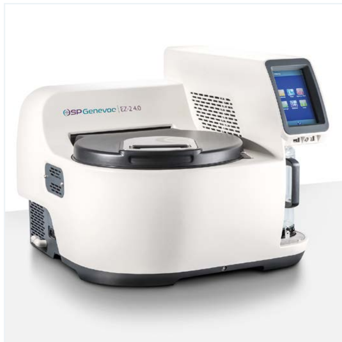
SP Genevac EZ-2 4.0