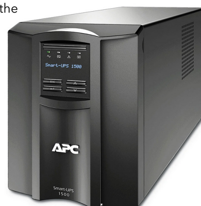
Fig. 1 APC Smart-UPS 1500 VA used for the experiments

the bridged power failure time of a KNAUER AZURA (U)HPLC system was measured under typical usage conditions connected to an APC Smart-UPS 1500 VA. We investigated the loading process of the UPS' battery to 100 %, when it is connected to a running HPLC system. Furthermore, we tested the influence of a higher power load, e.g. by an additional device like a preparative pump, on the bridging time.