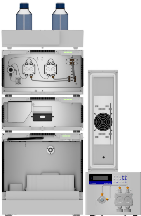
Fig. 3 KNAUER UHPLC system with additional preparative pump, used for the experiments